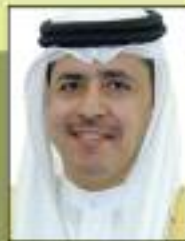
H.E. Fahmi Al Jowder Minister of Works Kingdom of Bahrain