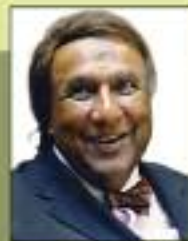
YBhg Tan Sri Datuk Sri Panglima Abdul Kadir Sheikh Fadzir Former Tourism Minister Malaysia