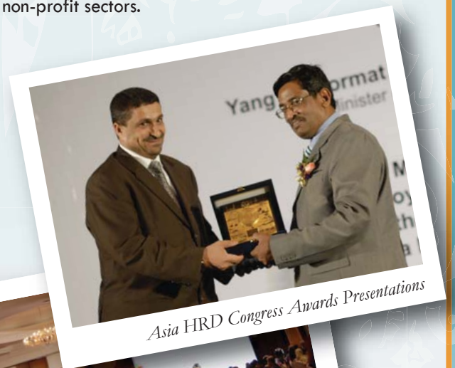
Asia HRD Congress Awards Presentations

This award is conferred to individuals who have made a lifetime contribution to Human Resources Development. They are usually individuals who have either pioneered selflessly to promising the cause of learning or creating a body of knowledge that has impacted the entire Human Resources Development community and their customers in government, private and non-profit sectors.