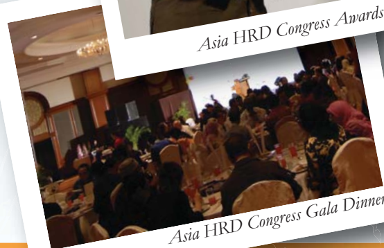
Asia HRD Congress Gala Dinner